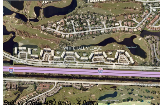
Built in 1985 - 480 units - 4 floors