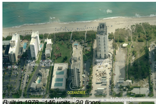
Built in 1978 - 146 units - 20 floors