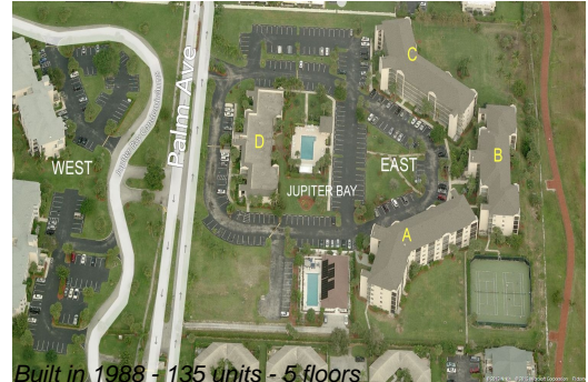
Built in 1988 - 135 units - 5 floors

http://www.jupiterbaycondoassoc.com/id63.html