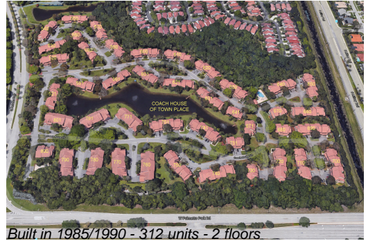
Built in 1985/1990 - 312 units - 2 floors