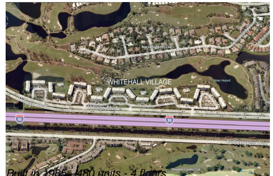
Built in 1985 - 480 units - 4 floors