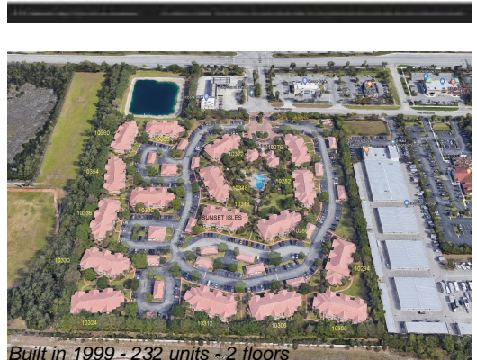
Built in 1999 - 232 units - 2 floors