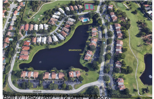
Built in 1982/1989 - 112 units - 2 floors