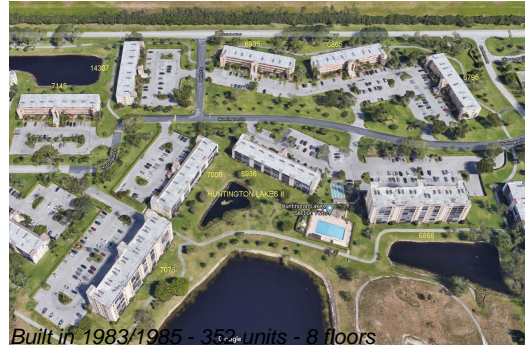
Built in 1983/1985 - 352 units - 8 floors

The above valuated price is a baseline figure that does not take into account any specific renovation, upgrade, split, merge, or deterioration of the unit.