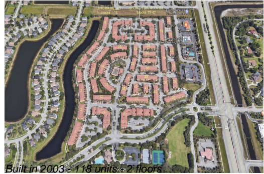
Built in 2003 - 118 units - 2 floors