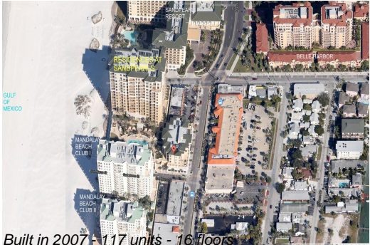
Built in 2007 - 117 units - 16 floors

Number of units: 117 Number of active listings for rent: 0 Number of active listings for sale: 7 Building inventory for sale: 5% Number of sales over the last 12 months: 3 Number of sales over the last 6 months: 2 Number of sales over the last 3 months: 1