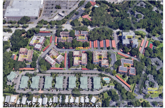
Built in 1972 - 370 units @ 8 floors

Number of units: 370 Number of active listings for rent: 0 Number of active listings for sale: 23 Building inventory for sale: 6% Number of sales over the last 12 months: 16 Number of sales over the last 6 months: 8 Number of sales over the last 3 months: 3