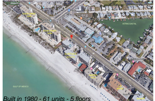
Built in 1980 - 61 units - 5 floors

Number of units: 61 Number of active listings for rent: 0 Number of active listings for sale: 2 Building inventory for sale: 3% Number of sales over the last 12 months: 2 Number of sales over the last 6 months: 1 Number of sales over the last 3 months: 1