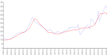
Continental Towers vs Clearwater