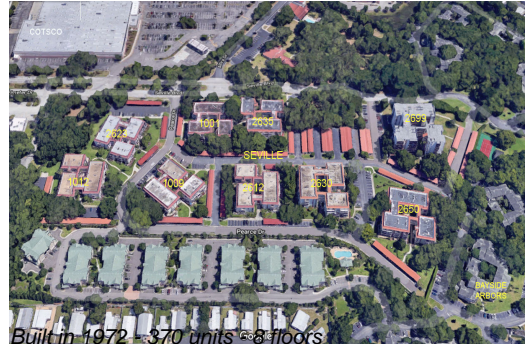
Built in 1972 - 370 units - 8 floors

Number of units: 370 Number of active listings for rent: 0 Number of active listings for sale: 23 Building inventory for sale: 6% Number of sales over the last 12 months: 16 Number of sales over the last 6 months: 8 Number of sales over the last 3 months: 3