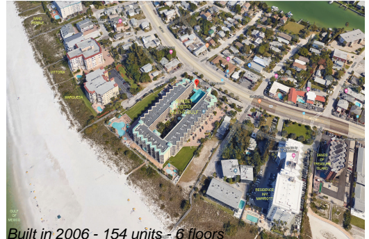
Built in 2006 - 154 units - 6 floors