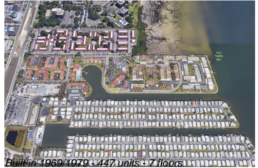
Built in 1969/1979 - 447 units - 7 floors

Number of units: 447 Number of active listings for rent: 0 Number of active listings for sale: 20 Building inventory for sale: 4% Number of sales over the last 12 months: 23 Number of sales over the last 6 months: 11 Number of sales over the last 3 months: 8