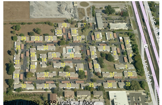
Building # 160 - 228 units - 1 floor