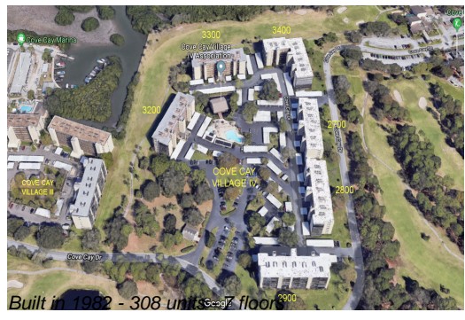
Built in 1982 - 308 units - 5th floor