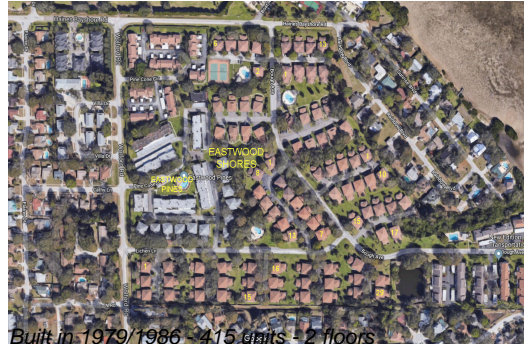
Built in 1979/1986 - 415 units - 2 floors

Number of units: 415 Number of active listings for rent: 0 Number of active listings for sale: 13 Building inventory for sale: 3% Number of sales over the last 12 months: 15 Number of sales over the last 6 months: 7 Number of sales over the last 3 months: 4