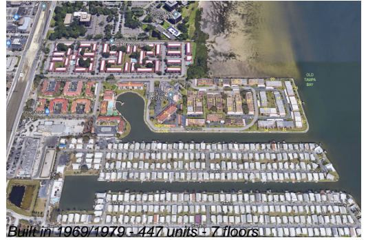
Built in 1969/1979 - 447 units - 7 floors

MLS Number: U8235553 Status: ACTIVE Size: 1,060 Sq ft. Bedrooms: 2 Full Bathrooms: 2 Half Bathrooms: 0 Parking Spaces: View: Water List Price: $319,000 List PPSF: $301