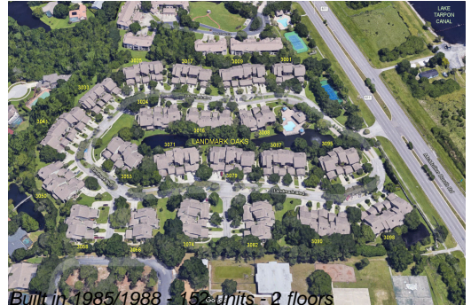
Built in 1985/1988 - 152 units - 2 floors

Number of units: 152 Number of active listings for rent: 0 Number of active listings for sale: 4 Building inventory for sale: 2% Number of sales over the last 12 months: 7 Number of sales over the last 6 months: 1 Number of sales over the last 3 months: 0