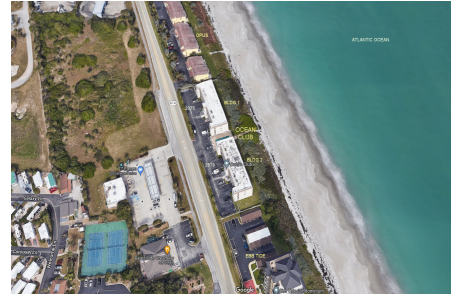
Built in 1982 - 24 units - 3 floors

Ocean Club Address: 2981 S Hwy A1A, Melbourne Beach, FL 32951