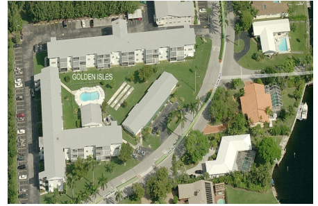
Built in 1966 - 70 units - 3 floors

Golden Isle Condo Apts 700 Layne Boulevard Hallandale Beach, FL 33009-6551 (954) 457-8132