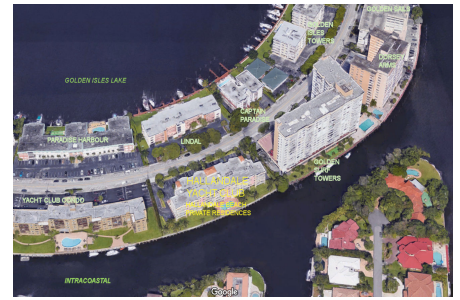
Built in 2004 - 44 units - 5 floors