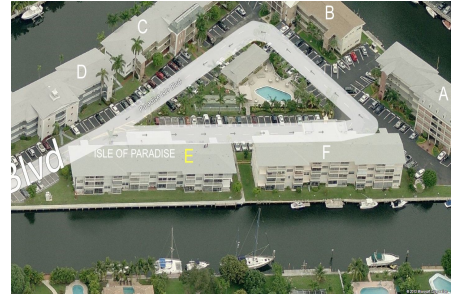
Built in 1965 - 30 units - 3 floors

Isle Of Paradise B Inc Monticell 450 Paradise Isle Boulevard Hallandale Beach, FL 33009-5896 (954) 458-8498 Isle of Paradise C Inc 460 Paradise Isle Blvd Hallandale Beach, FL 33009 (954) 456-6084