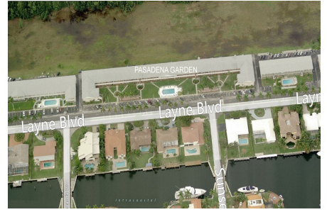
Built in 1965 - 66 units - 2 floors

Coastal Garden Condominium Inc 630 Layne Boulevard Apartment 109 Hallandale Beach, FL 33009-8613 (954) 456-9783