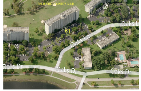
Built in 1975 - 100 units - 10 floors

Mwi/Campbell Management Co, Palm Aire Country Club Condominium Association 3500 Gateway Drive # 202 Pompano Beach, FL 33069-4870 (954) 968-4481