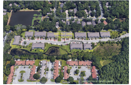
Built in 2006 - 60 units - 2 floors

Amberly Oaks Townhomes Association, Inc. 1.800.647.0055 The Melrose Management Partnership 3527 Palm Harbor Blvd Palm Harbor, FL 34683 727-787-3461 http://melrosecorporation.com/amberly-oaks-townhomes/