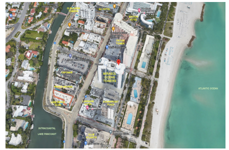
Built in 1975 - 251 units - 25 floors

Mirasol Ocean Towers Address: 2655 Collins Ave, Miami Beach, FL 33140 Phone: +1 305-532-0526