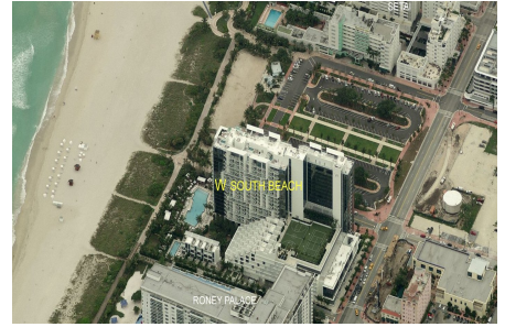
Built in 2009 - 408 units - 19 floors

W South Beach Condominium (305) 938-3000