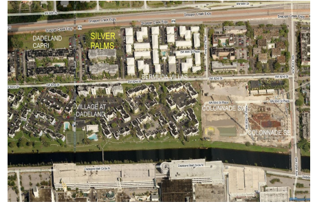
Built in 1968 - 69 units - 3 floors

Silver Palms Dadeland Condominium Association 305 669 2798 & (305) 667-1449