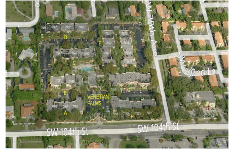
Built in 1971 - 208 units - 2 floors

Venetian Palms Clubhouse 7941 SW 104th Street Miami, FL 33156-3631 (305) 274-8032