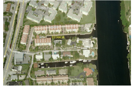
Built in 2008 - 30 units - 3 floors

Estancia At Boynton Beach Homeowners Association 601 N Congress Avenue # 114 Delray Beach, FL33445-4703 (561) 272-1025