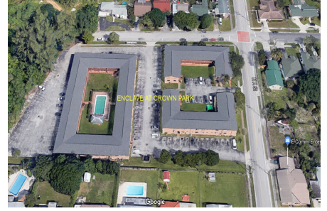
Built in 1971 - 86 units - 2 floors

Enclave of Palm Beach 3170 S Ocean Blvd Palm Beach, FL 33480 (561) 582-1100