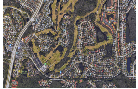
Built in 1981/1986 - 221 units - 2 floors

Tarpon Woods No 4a Condominium Association, Inc 3800 Josie Lane Apartment 3 Palm Harbor, FL 34685 Phone: (727) 773-8070 http://www.tarponwoodscommunity.com