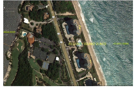
Built in 1996 - 72 units - 13 floors

Regency Island Dunes Association, Inc 8600 S Ocean Drive Jensen Beach, FL 34957 (772) 229-0311 http://Regencyislanddunes.com