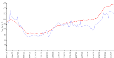
Residences on Hollywood West vs Hollywood Beach