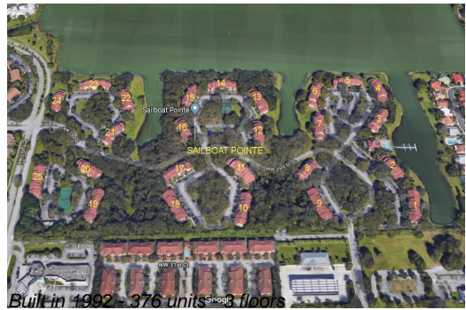
Built in 1992 - 376 units - 5th floors