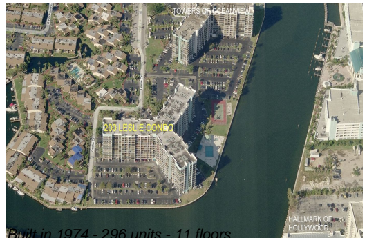
Built in 1974 - 296 units - 11 floors