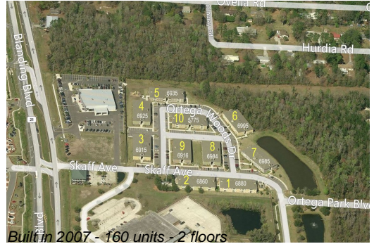
Built in 2007 - 160 units - 2 floors