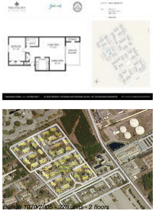
Built in 1970/2005 - 320 units - 2 floors