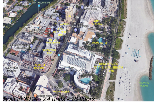
Built in 2014 - 24 units - 18 floors