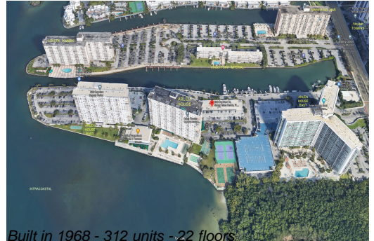
Built in 1968 - 312 units - 22 floors