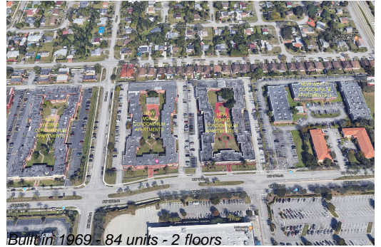
Built in 1969 - 84 units - 2 floors