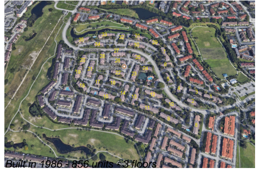
Built in 1986 - 856 units - 603 floors