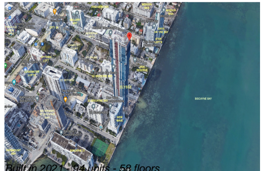
Built in 2021 - 94 Units - 58 floors