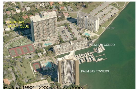
Built in 1982 - 233 units 27 floors