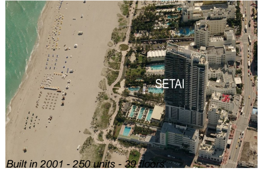
Built in 2001 - 250 units - 39 units for sale