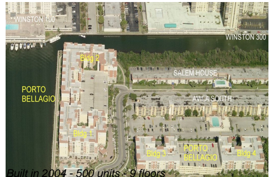
Built in 2004 - 500 units - 9 floors