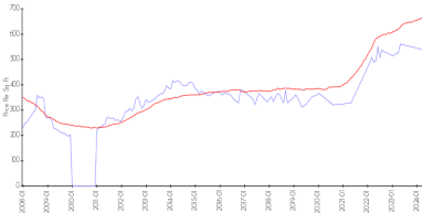
Avenue On Brickell (West Tower) vs Miami